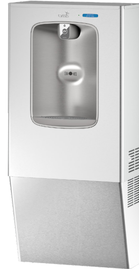
*Drinking Fountain Not Included