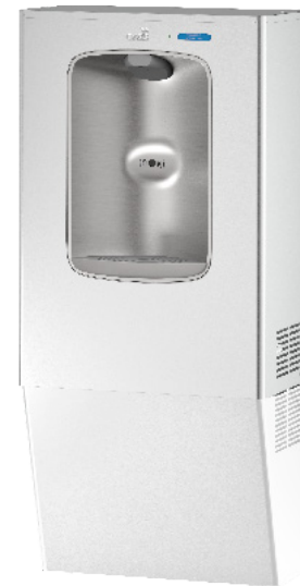
*Drinking Fountain Not Included