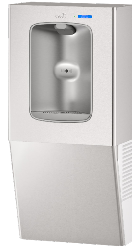
*Drinking Fountain Not Included